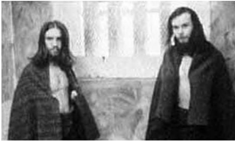
THE BLANKET MEN